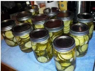
Holy Cross Pickles!